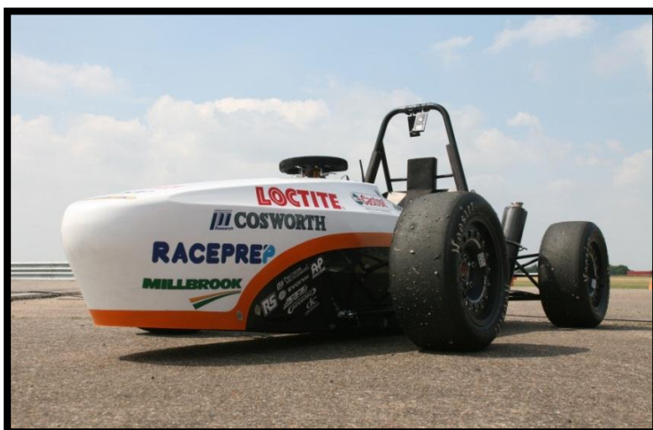
UH14 after a test at Bruntingthorpe Proving Ground www.uhracing.co.uk